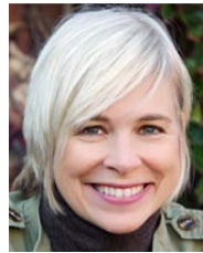
Jeanie Duncan Foundation President