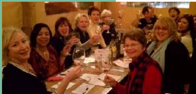
And, a Happy Holiday greeting from all the WHINE Divas to all of you!