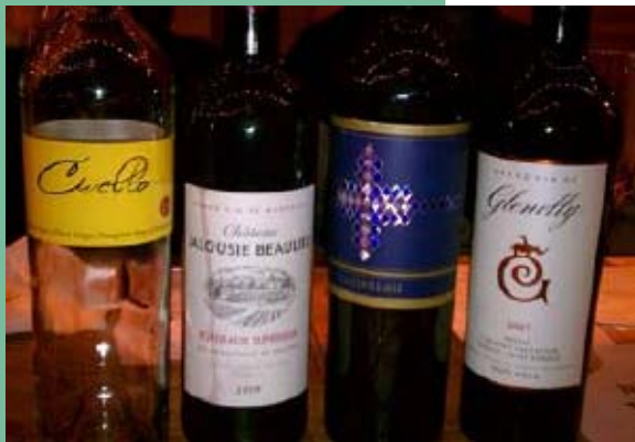
Tasting Room is a discount wine shop with great selections...stop in during the holidays.

From California white, to a Bordeaux with a great fragrance, to a rich Spanish red, to the South African cab/syrah/petite verdot with gorgonzola OR dark chocolate. Most of us lingered over some warming reds and ordered from the food truck across the street (El Azteca taco truck). WPF